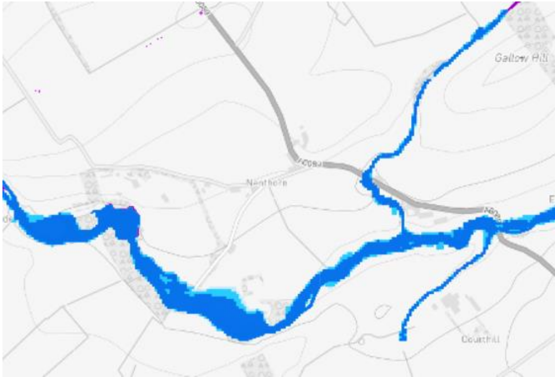
Figure 1: Extract from The Scottish Environment Protection Agency (SEPA) highlighting the areas at risk of flooding in blue.

2.8 The Scottish Environment Protection Agency (SEPA) are the statutory body for flood management in Scotland and maintain flood risk maps for public and development purposes. The site does not fall in an area at risk of flooding which is identified in figure 1 below.